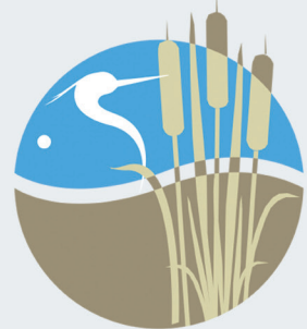
Conservation of Iranian Wetlands Project "Saving Wetlands: for People, for Nature"