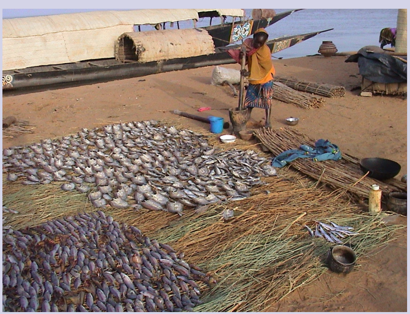
Drying fish, Inner Niger Delta.

The project hopes to bring about improvements in policies of specific international decision-making bodies like the Ramsar Convention, CBD and regional authorities in Africa, Latin America and Asia so that the role of wetlands in poverty alleviation is recognized in appropriate policy documents. At this international level, Wetlands