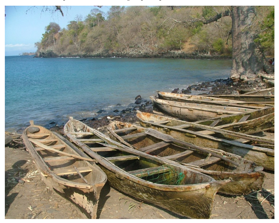
Fishing boats in Sao Tomé and Principe.

All decisions of the Ramsar COPs are available from the Convention's web site at http://www.ramsar.org/index_key_docs.htm#res. Background documents referred to in these handbooks are available at http://www.ramsar.org/cop7/cop7_docs_index.htm, http://www.ramsar.org/cop8/cop8_docs_index_e.htm, and http://www.ramsar.org/cop9/cop9_docs_index_e.htm.