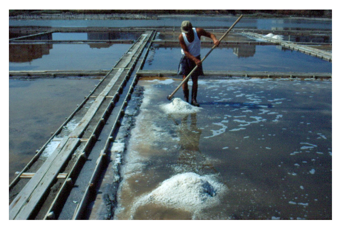
At this working saltpan in the town of Pomorie, an important tourist resort on the Black Sea coast of Bulgaria, there are plans to establish a salt museum and to train young salters in the traditional craft.

In addition to the CBD's description of "ecosystem approach", there are a number of other definitions and descriptions in current use. These include the definition used by the OSPAR and Helsinki Commissions (Declaration of the First Joint Ministerial Meeting of the Helsinki and OPSAR Commissions, June 2003) and the description and eleven principles applied by the US Fish and Wildlife Service.