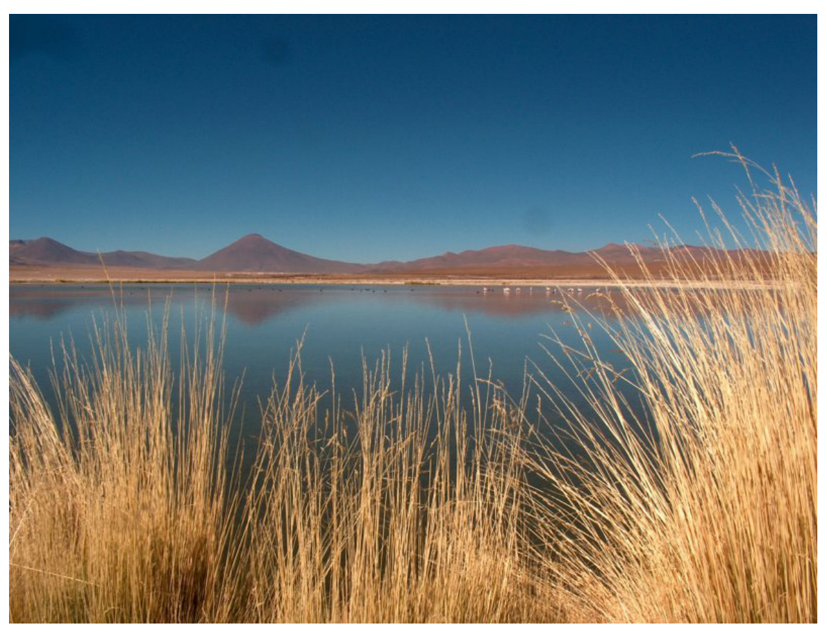
Careful allocation of water resources is especially important in arid areas, as at this High Andean Ramsar site in Chile, the Salar del Huasco.

All Resolutions of the Ramsar COPs are available from the Convention's Web site at www. ramsar.org/resolutions. Background documents referred to in these handbooks are available at www.ramsar.org/cop7-docs, www.ramsar.org/cop8-docs, www.ramsar.org/cop9-docs, and www.ramsar.org/cop10-docs.