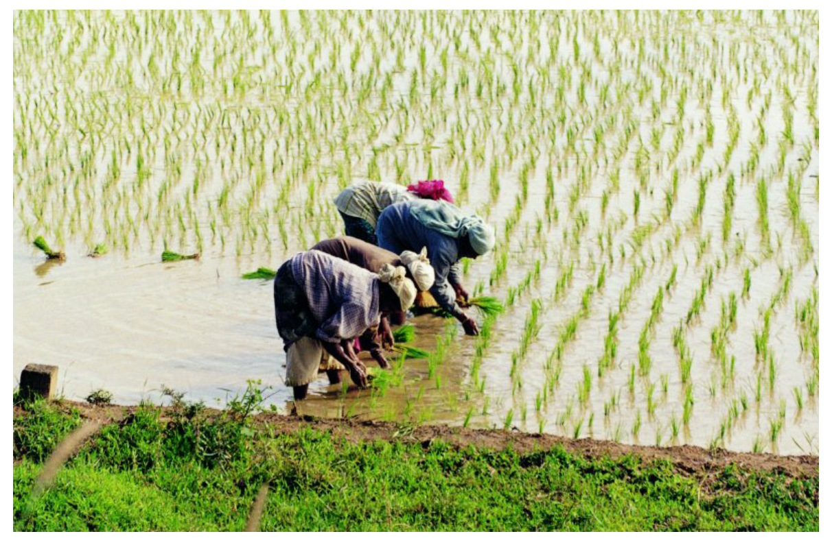
Women sowing rice seedlings, Palakkad, Kerala State, India.

73. Water resources are usually important from an economic point of view. The economic value of a water resource is traditionally assessed in terms of the amount of water which can be abstracted for offstream use. Typical indicators include the number and value of jobs generated by the use of the water or the amount of revenue generated.