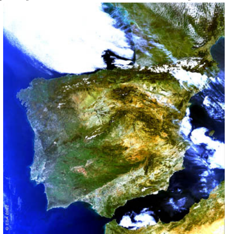
The European Space Agency's Globwetland project is producing satellite-derived and geo-referenced products for 50 Ramsar sites around the world, developing new Earth Observation tools to help the managers of Ramsar sites and other wetlands monitor ecosystem changes and assess water allocation needs. The Iberian peninsula from the MERIS satellite, 2002. Photo: courtesy ESA . http://www.esa.int/esaCP/SEM0PFXLDMD_index_0.html.