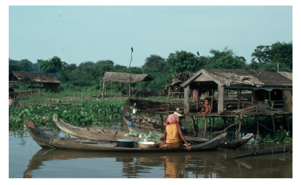
The productivity of Tonle Sap lake in Cambodia can be protected by maintaining the regular hydrological regime of the Mekong River and protecting the habitats in the surrounding inundated plain.

All Resolutions of the Ramsar COPs are available from the Convention's Web site at www. ramsar.org/resolutions. Background documents referred to in these handbooks are available at www.ramsar.org/cop7-docs, www.ramsar.org/cop8-docs, www.ramsar.org/cop9-docs, and www.ramsar.org/cop10-docs.