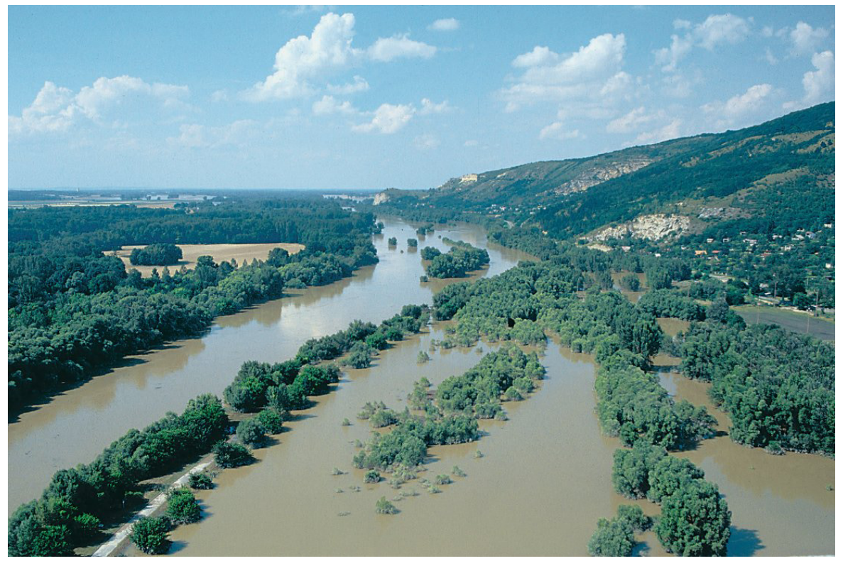
Maintaining the natural floodplain in this part of the Morava River in Slovakia ensures the retention and slow release of floodwaters -- and produces rich floodplain grasslands that support non-intensive agriculture and a high biological diversity.