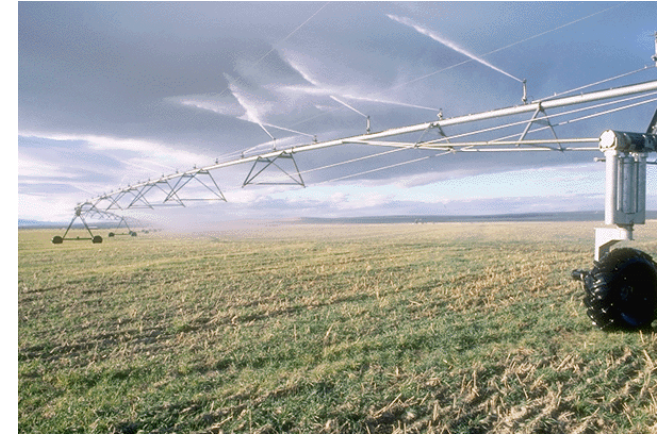
Irrigation in intensive agriculture.

124. Irrigation agriculture is one of the largest water use sectors in the world, using up to two-thirds of all freshwater removed from rivers, streams, lakes and aquifers<sup>40</sup>. In many countries, irrigation is still carried out by age-old gravityfed techniques, channeling water through furrows into